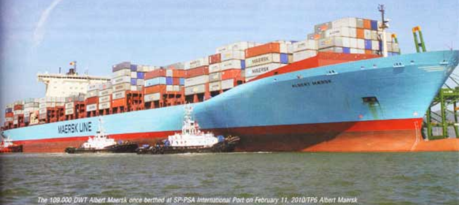
The 109,000 DWT Albert Maersk once berthed at SP-PSA International Port on February 11, 2010/TP6 Albert Maersk

The colossal container ship Mathilda Maersk of Maersk Lines carrying 6,000 TEUs sailed smoothly into SP-PSA International Port in Ba Ria-Vung Tau Province, marking the first-ever time in Vietnam's shipping history a Vietnamese port received a ship as large as 116,000 DWT, 367 metres long and 43 metres broad with an installed capacity of 9,000 TEUs. Marking the occasion, the Maersk Lines Group inaugurated a new direct sea route to the US.